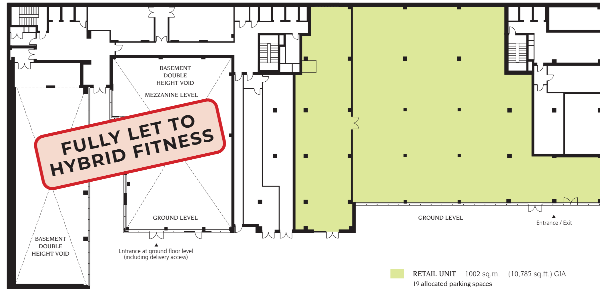
PLANS SHOWING DEMISE OF CURRENT RETAIL SHELL SPACE

THE CURRENT RETAIL & SERVICE AREA HAS POTENTIAL TO PROVIDE SPACE TO LET FROM 3,000 SQ.FT. TO 11,000 SQ.FT. APPROX (SUBJECT TO PLANNING)